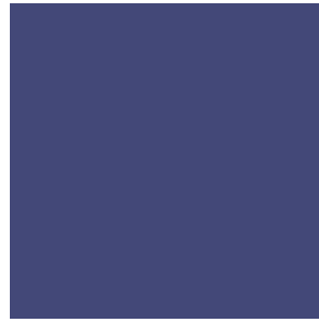
AZUL IK 100