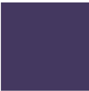
VIOLETA INTENSO LV