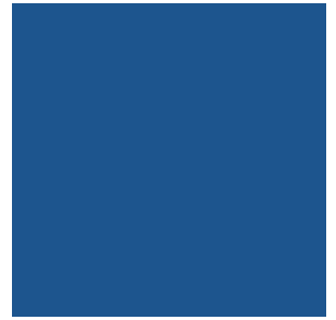
AZUL REFLEX SD