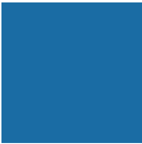
CYAN PROCESO T2