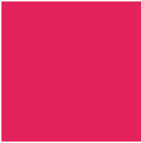
MAGENTA PROC PLUS