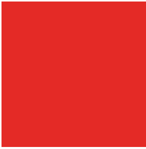
ROJO BASICO MP 200