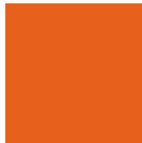
NARANJA BRILLANTE KF