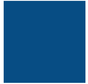
AZUL OSCURO ST