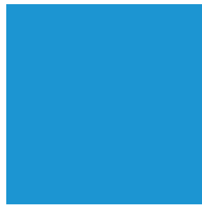
CYAN PROCESO PLUS