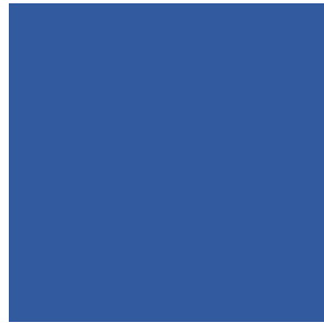
AZUL IK 100